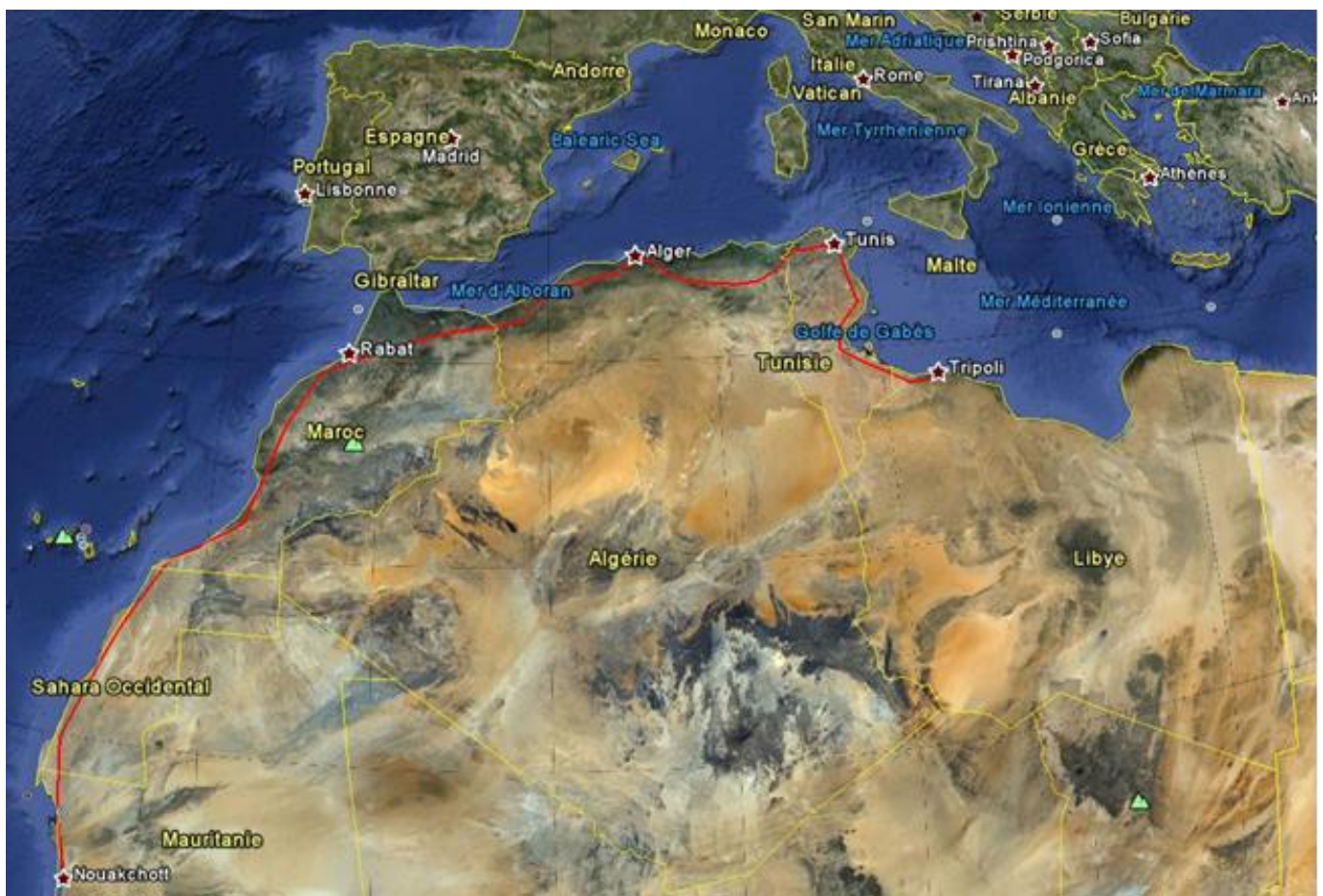
Figure1: Path of the Trans-Maghreb Highway