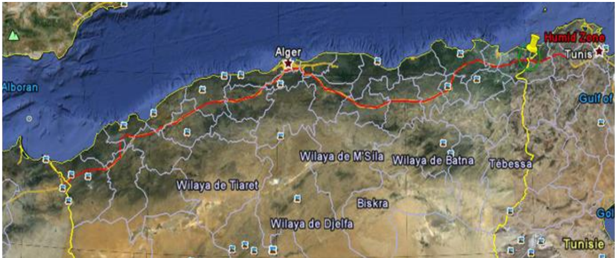
Figure 2: Path of the actual Algerian section of the Highway.